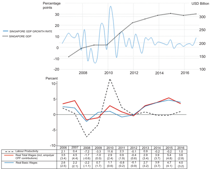
Figure 1. Singapore's GDP, GDP growth rate, labor productivity and real wages

Source(s): Survey on Annual Wage Changes, Manpower Research and Statistics Department, Ministry of Manpower; Ministry of Trade and Industry (for Productivity data); and The World Bank (for GDP data)